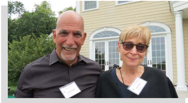
Garden Party candids